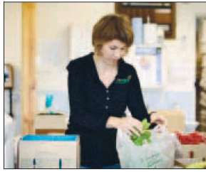
Organic Angels has just won a state industry award for environmental sustainability.